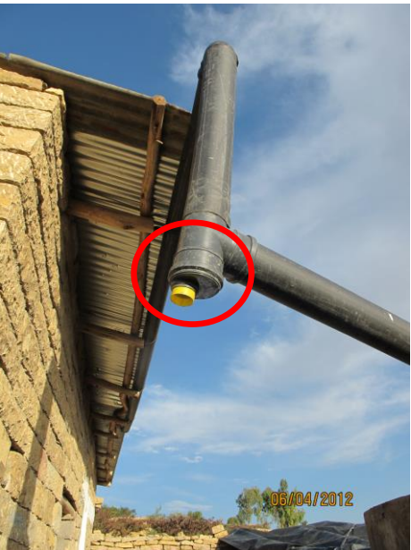
Pictures above: Roof catchment and first splash discharge installation

Roof-water is collected in a slid-open PVC pipe attached to the corrugated iron sheet roof. A first splash discharge outlet (red circle) allows users to discharge dirty roof-water for a short while when rainfall starts. The outlet is then closed manually, and clean roof-water is collected in the cistern.